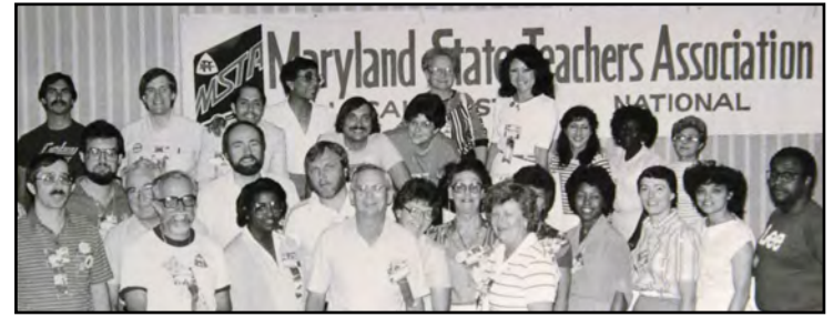
Are you in this photo? There are at least 3 past TABCO presidents in this group of convention attendees. Can you identify them?

A slide show of TABCO photographs is being prepared for the celebration. If you have an interesting photo, perhaps from a rally, a special event, etc., or an artifact or significant document, and are willing to share, please contact Angela Leitzer at bookends68@comcast.net .